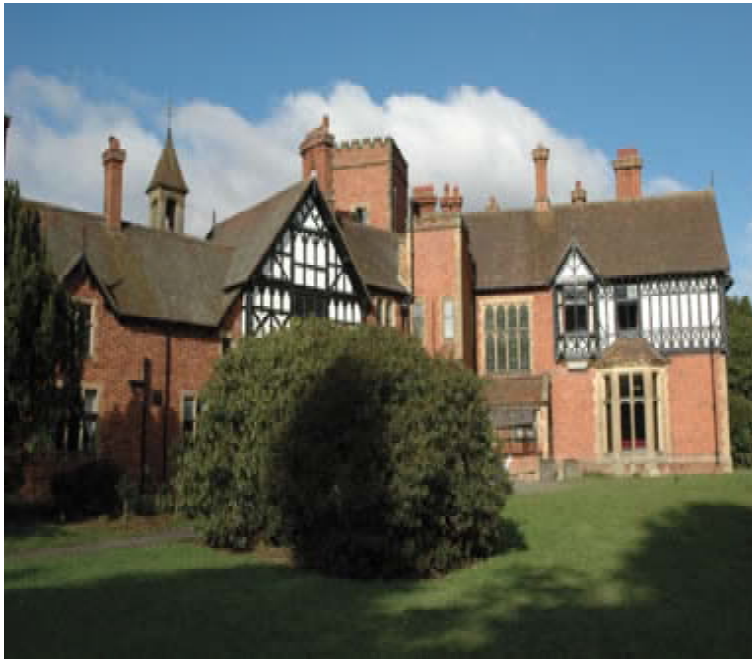
Llangollen Youth Hostel, Dee Valley, North Wales